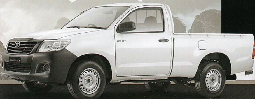
Tipe Single Cab (Deck) M/T

Kini Toyota Hilux Single Cab (Deck) dengan mesin Diesel 2.5 L D-4D Turbo