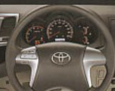
NEW 4 Spokes Steering Wheel with Steering Switch

Tipe G-Double Cabin memiliki semua kelengkapan Tipe E-Double Cabin / G-Double Cabin Type has all E-Double Cabin Type specifications combined with: