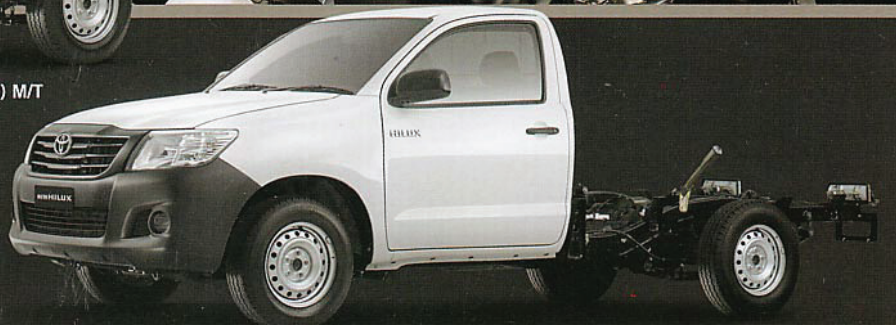
Tipe Cab & Chassis M/T (C&C) kini dilengkapi power steering (with power steering)

Tampil makin modern dan stylish , Toyota Hilux Single Cab (Deck) kini hadir dengan varian baru versi Diesel untuk mendukung bisnis Anda. Bahkan Tipe Cab & Chassis juga dilengkapi power steering . Ruang kabinnya yang ergonomik makin nyaman dan makin lengkap dengan fitur.