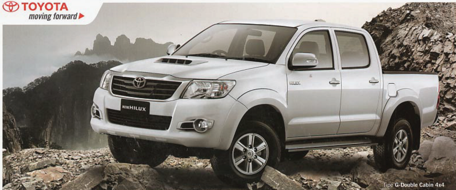
Tipe G-Double Cabin 4x4