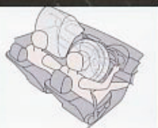
Dual SRS Airbags