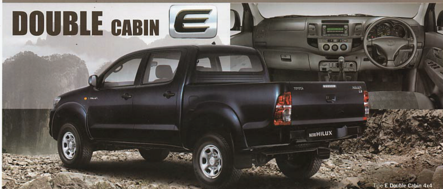
Tipe E Double Cabin 4x4