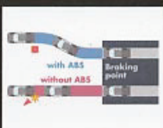
Anti-lock Braking System (ABS)