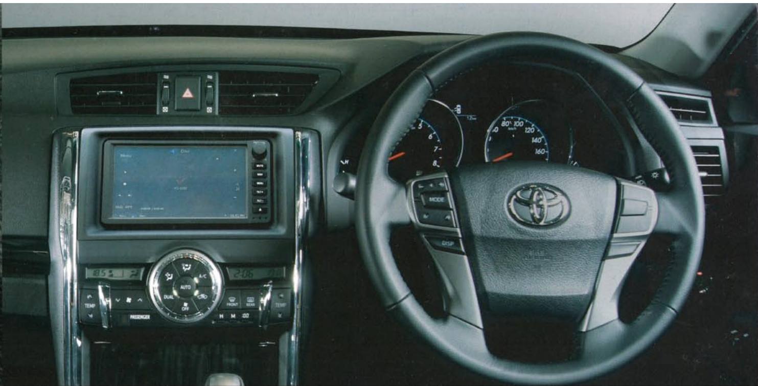
Deluxe cabin feel is given to please the passengers in supple and delight environment.