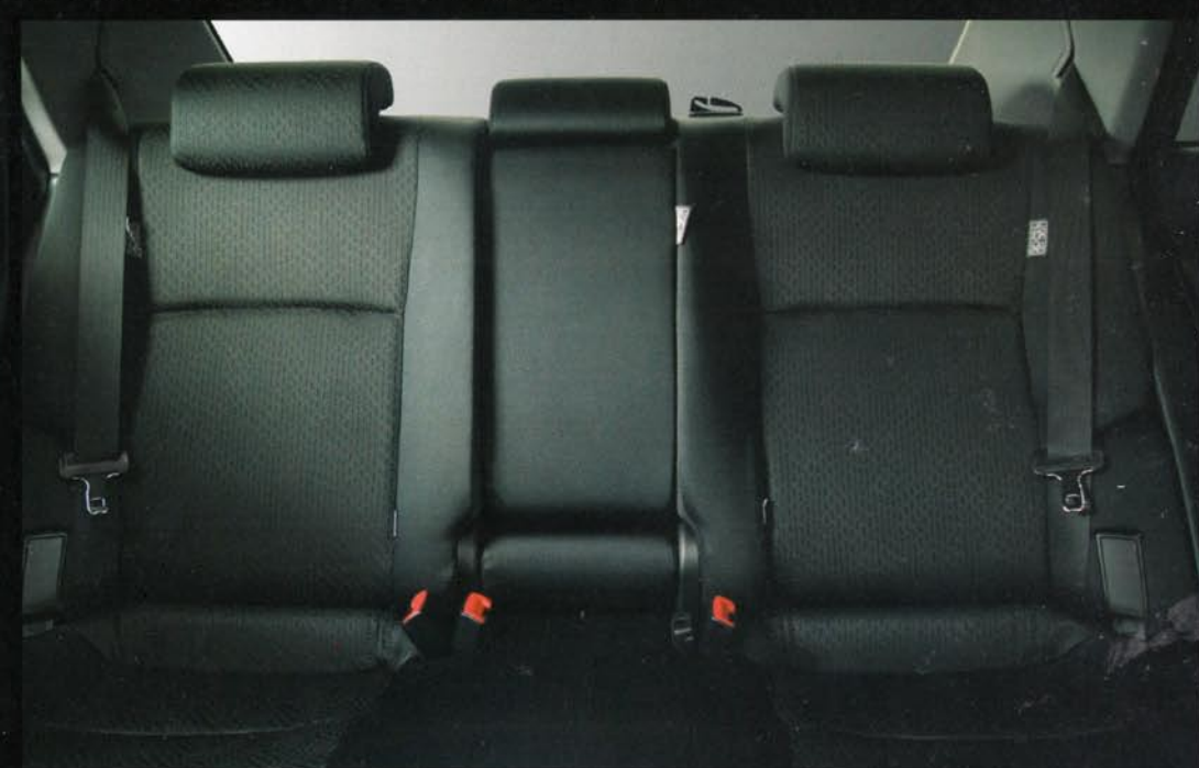
Spacious rear seat to accomodate passengers.