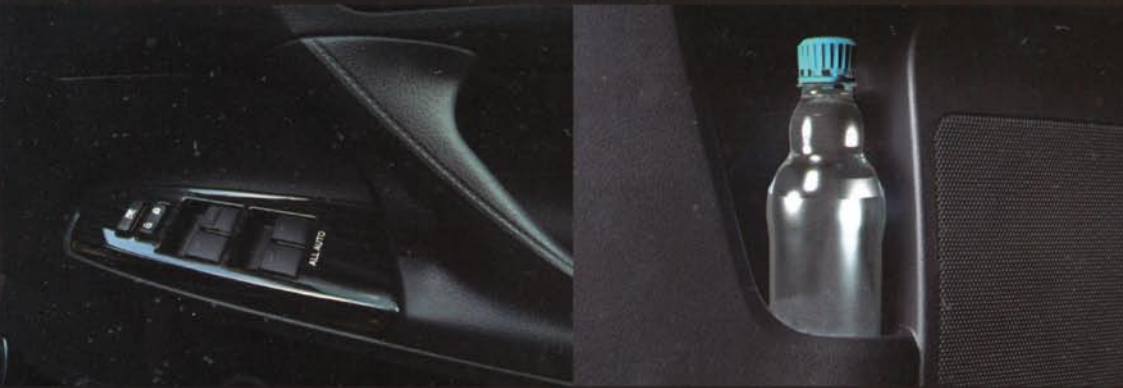
Elegant Door Trim and Window Control.