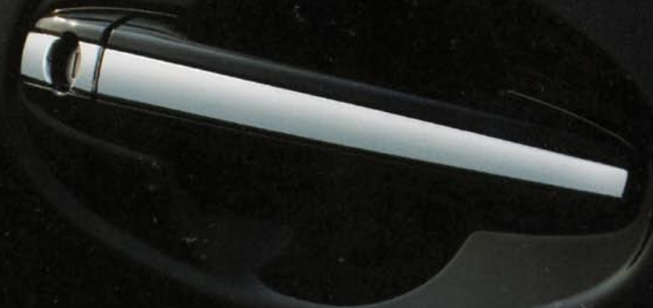
Smart Door Handle.