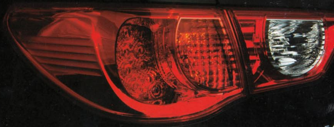
Futuristic Design Taillight.