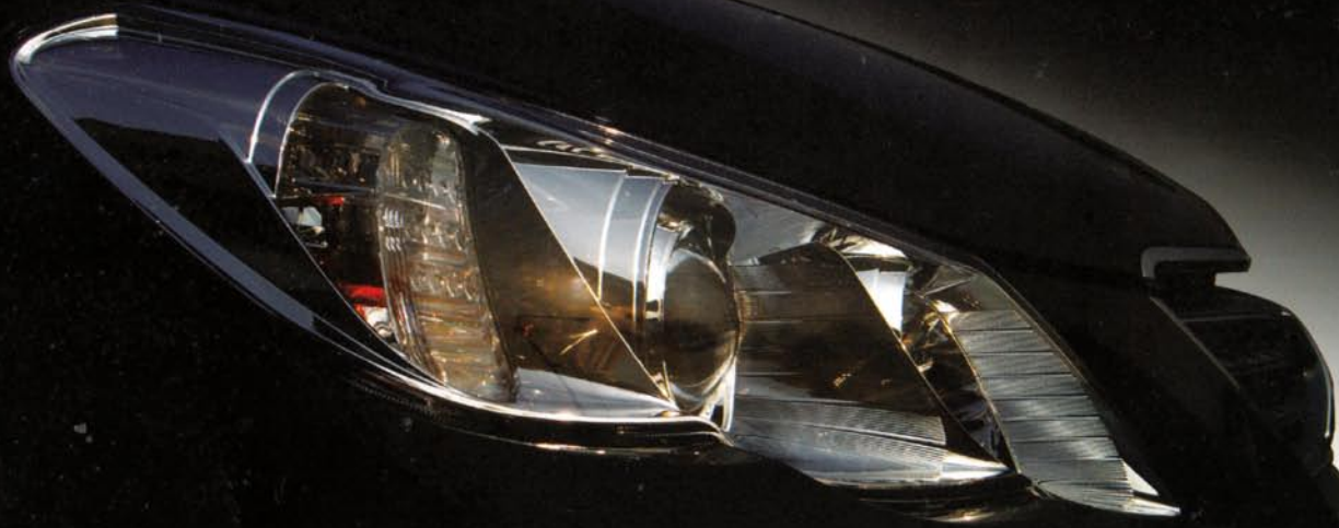
Brilliant Design Head Lamp.