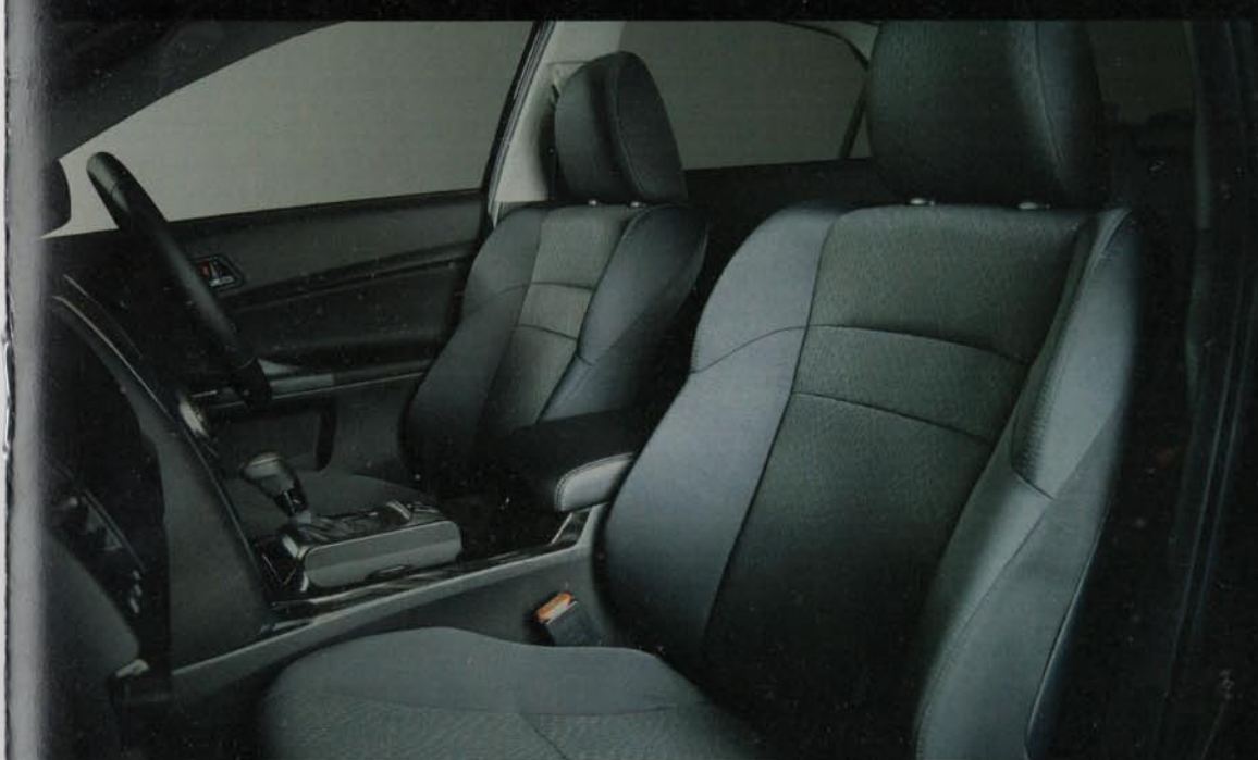
Driver's seat features a switch-operated motorized lumbar support.