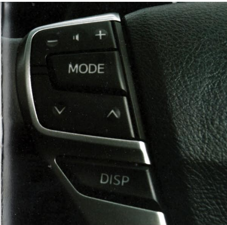
Steering Switch Control for Audio.