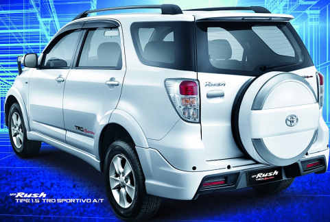
Rush Tipe 1.5 TRD Sportivo A/T