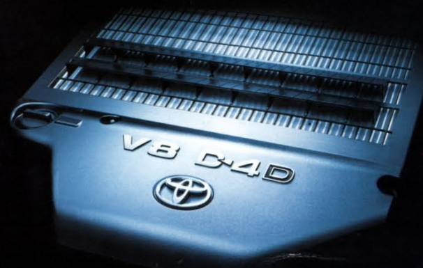
4.5L V8 Diesel Engine 1VD-FTV

Frame and body merge in an unequalled synergy of strength . The resulting union of rugged durability, rigid strength, and ride stability is unique among full size 4WDs, forming the foundation and ensuring the continuity of the Land Cruiser legend.